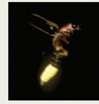
dense ring of energy-producing structures called mitochondria in the periphery of the lantern cells. Normally, the oxygen would bind to cytochrome oxidase in

Insects breathe through tubules, called trachea, that connect the outside world to cells in the body via a network of increasingly fine branches. The ends of these, called tracheoles, abut cells and allow oxygen to diffuse outwards. In fireflies, when oxygen passes from tracheoles into the lantern cells, it must run the 'gauntlet' — a